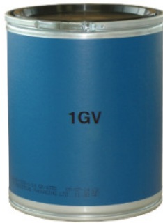
1 GV Drums – External Lacquered