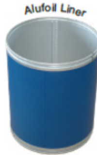
Alufoil lining prevents moisture and vapour discharge